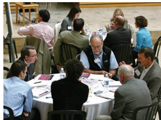
Breakout working session by participants of the June 2007 Discussion Forum, Rotman School of Management, University of Toronto, Canada

The study was presented at the June 2007 Discussion Forum held at Rotman School of Management, University of Toronto (Canada).